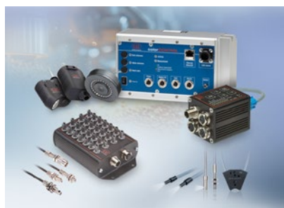
Color recognition sensors, LED analyzers and inline color spectrometers