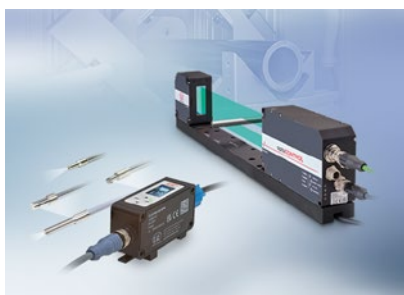
Optical micrometers and fiber optics, measuring and test amplifiers