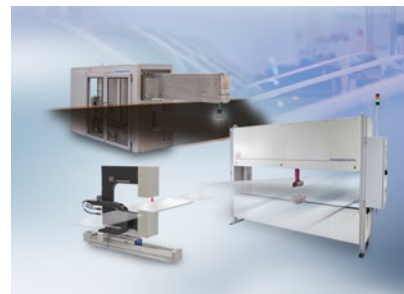
Measuring and inspection systems for metal strips, plastics and rubber