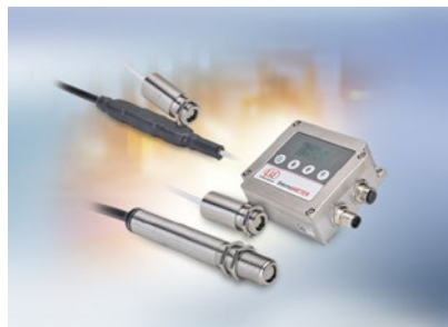
Sensors and measurement devices for non-contact temperature measurement